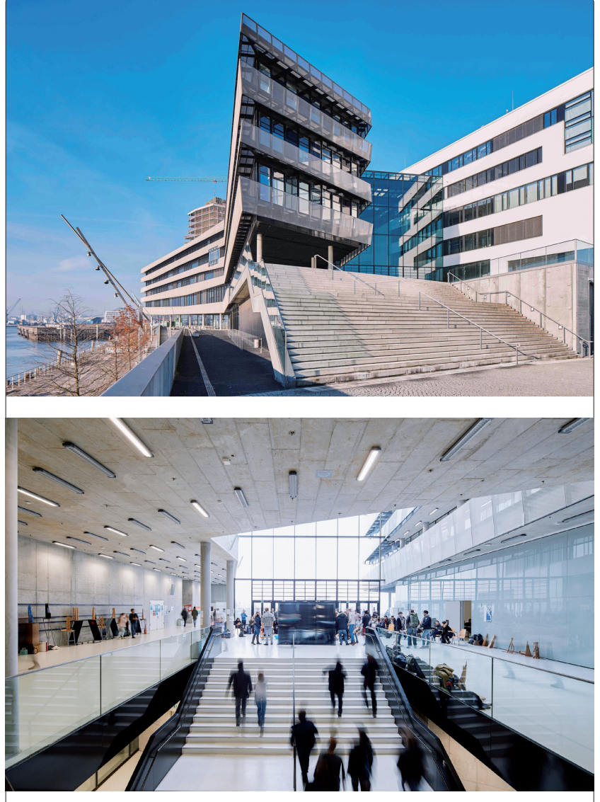
Fig. 1: Location of HafenCity University Hamburg on the river Elbe (top) and its interior (bottom)

The discipline of »Geodesy and Geoinformatics« at HCU does not have an ordinary structure com-