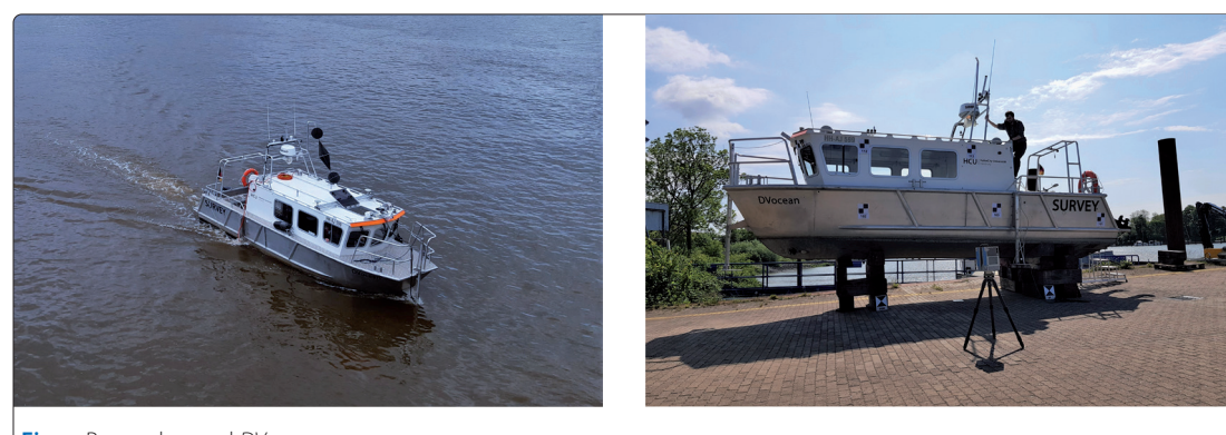
Fig. 3: Research vessel DVocean

in shallow waters to explore and monitor primary inland waterways and their built-up banks. Moreover, areas of application include the investigation of new approaches for position determination and bottom structure analyses to determine the stability of buildings and underwater structures. Initial measurements to create test fields for hydrographic sensors will be further acquired and analysed.