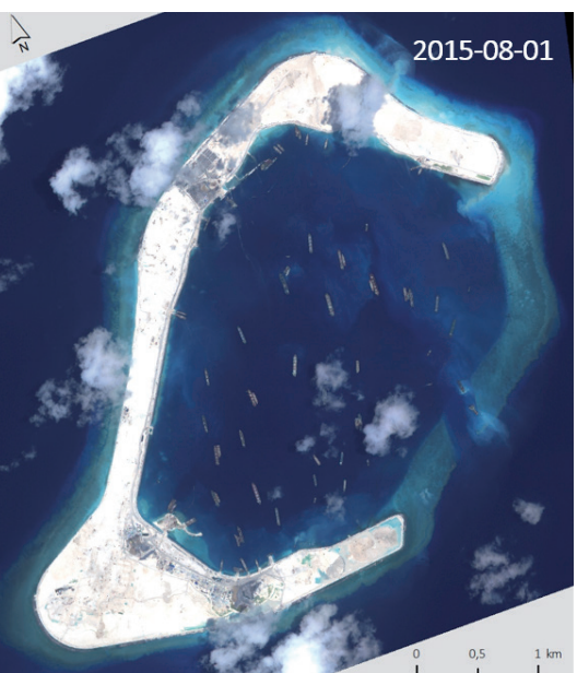
Fig. 1: Subi Reef, South China Sea. The imagery show the reef before (left) and following engineering activities of China (right)

case in 2014, after conflicts in the area of dispute.