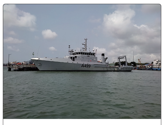
Fig. 7: NNS Lana in Lagos (Nigeria)

In addition, advice and expertise have been provided in the framework of exchanges with prospects in other countries. These partnerships contribute to develop Shom's expertise in hydrographic and oceanographic capacity building as well as they are also helping to develop the hydrographic cooperation and technical exchanges between the countries involved.