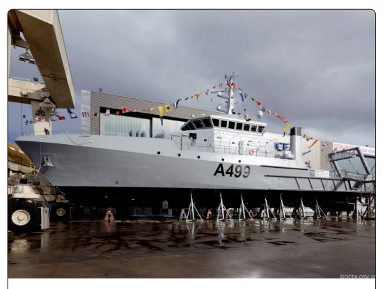
Fig. 6: NNS Lana before launching in Les Sables d'Olonne

full-time engineer. In 2021, a Nigerian team was trained both theoretically and practically during four weeks in Shom's school in Brest (France). They learned about the equipment of their new ship NNS Lana and participated in several practical sessions for using GNSS equipment and other related tools. Training also took place onboard the ship in France and on site in Nigeria (Fig. 7). The technical assistance phase in Lagos started end 2021 and will continue until 2023, with the support of a Category A hydrographic engineer full time for more than a year. During this technical assistance period Shom will help the Nigerian Navy to solve issues that can happen on the hydrographic and oceanographic vessel, assist in the configuration and use of the equipment and provide advice on how to make different types of survey. Once the surveys are made, guidance is provided on data processing, data validation and how to elaborate survey reports complying with IHO standards.