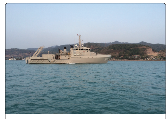
Fig. 5: Rigel , hydrographic and oceanographic vessel (Indonesia)