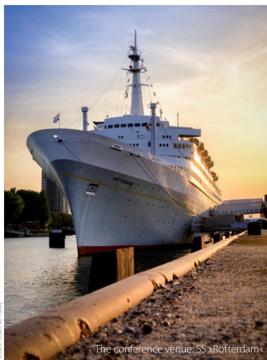
The conference venue: SS »Rotterdam«