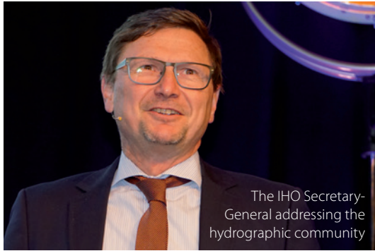
The IHO Secretary-General addressing the hydrographic community

a summary of efforts to disclose the natural processes on a geologic time scale. At nearly 80 he addressed the packed auditorium with a perfectly logical and convincing review of the four dimensions in relation to life on earth and the development of Earth System Science as a realistic new scientific discipline. Gaia revisited.