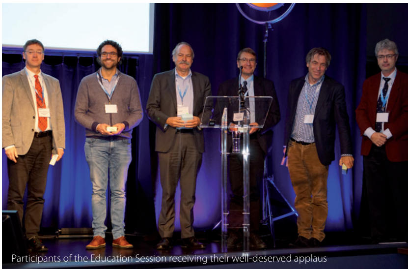
Participants of the Education Session receiving their well-deserved applause